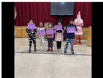
Second Grade Students of the Month