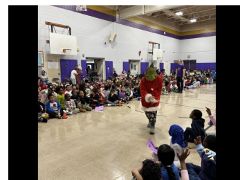
A surprise visitor showed up at the assembly!