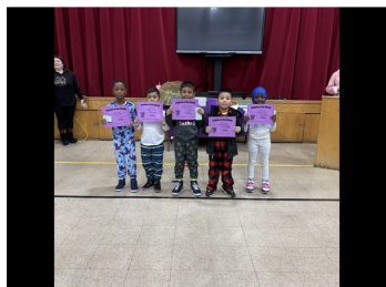
First Grade Students of the Month