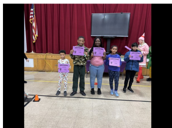
Fourth Grade Students of the Month