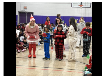
So did teachers and staff!