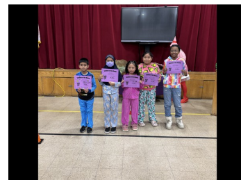
Third Grade Students of the Month