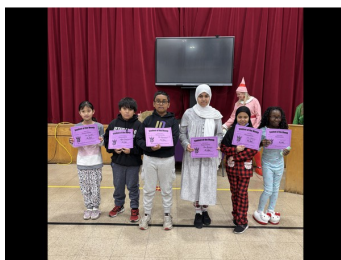
Fifth Grade Students of the Month