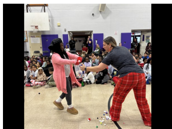
No Assembly is complete without our Minute to Win it Game!