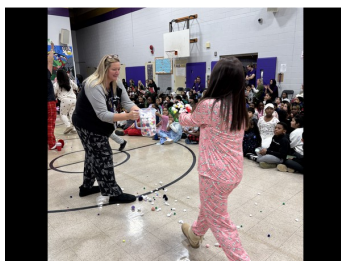
Students had so much fun!